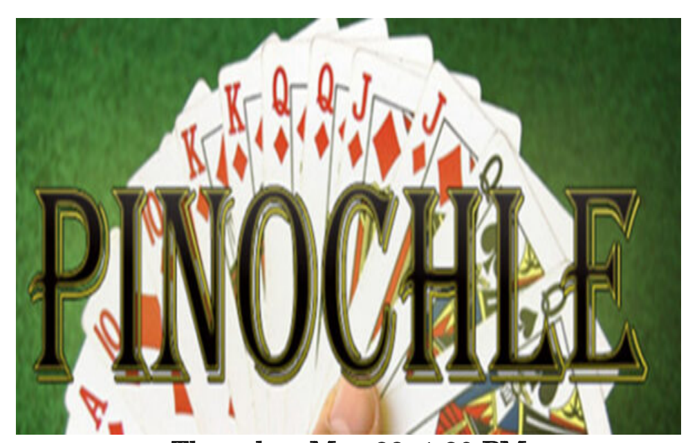
Thursday, May 22, 1:30 PM Sign-up sheet on table outside office

NEW DIRECTORY: Look for a draft of a church directory across from the church office and make any necessary changes by the end of May!