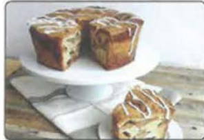
Apple Cake 52 oz. cake made from locally grown apples