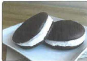
Whoopie Pies Pack of 6 chocolate whoopie pies with white filling