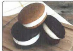
Mini Whoopie Pies Pack of 12 either Original or Variety (original, red velvet & pumpkin)