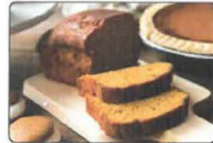
Pumpkin Bread 20 oz. loaf made from our own homegrown pumpkins