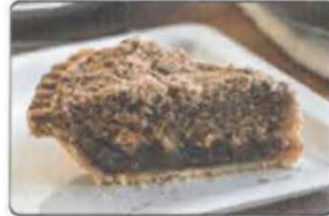
Shoofly Pie 10" shoofly pie made from Grandma Smucker's famous recipe