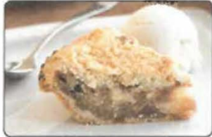
Apple Crumb Pie 10" apple pie with crumb topping and locally grown apples

Our fundraisers are designed to support your success, with a variety of homemade, high-quality baked goods - many made from fresh, local ingredients. You can feel good about selling them, and they're specially priced so you can raise funds for your organization.