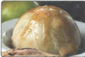
Apple Dumplings Pack of 2 apple dumplings made from locally grown apples