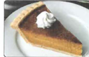
Pumpkin Pie 10" pumpkin pie made from our own homegrown pumpkins