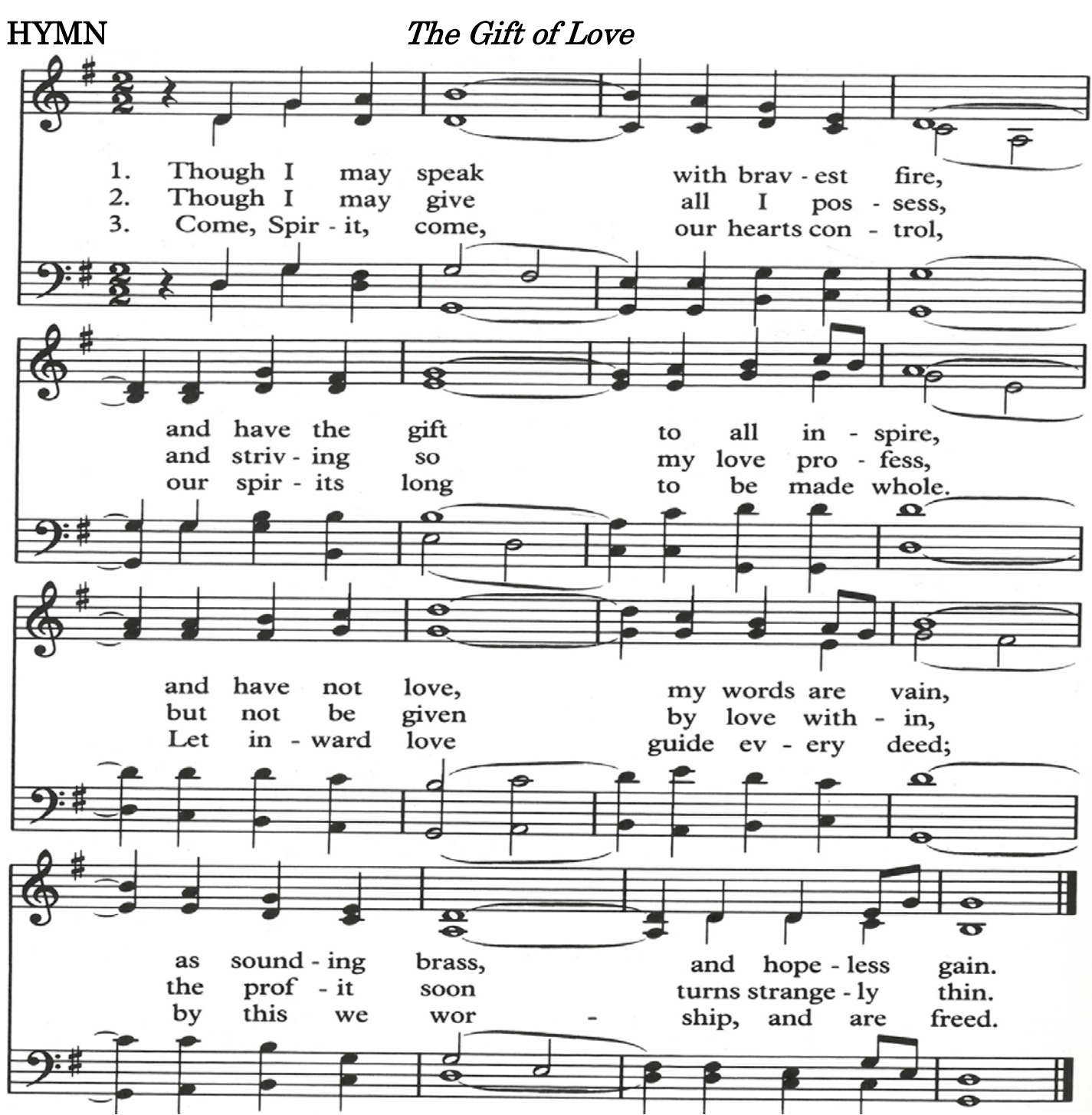
"The Gift of Love" words by Hal Hopson, music traditional English melody adapt. by Hal Hopson © 1972 Hope Publishing Co. All Rights Reserved. Reprinted under One License #A-711879.