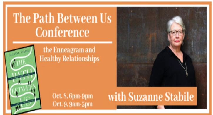
The Path Between Us: Enneagram Conference with Suzanne Stabile

October 8, 2021 - October 9, 2021 6:00 pm - 5:00 pm