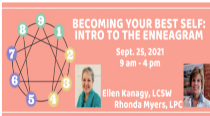
Becoming Your Best Self: Introduction to the Enneagram

October 8, 2021 - October 9, 2021 6:00 pm - 5:00 pm