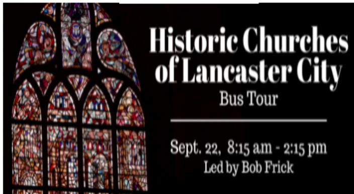
Historic Churches of Lancaster City