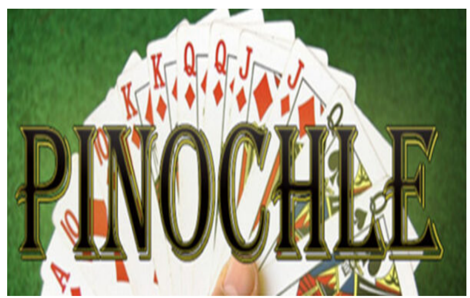
TUESDAY, April 22, 1:30 PM Sign-up sheet on table outside office

Donations are graciously accepted at the breakfast.