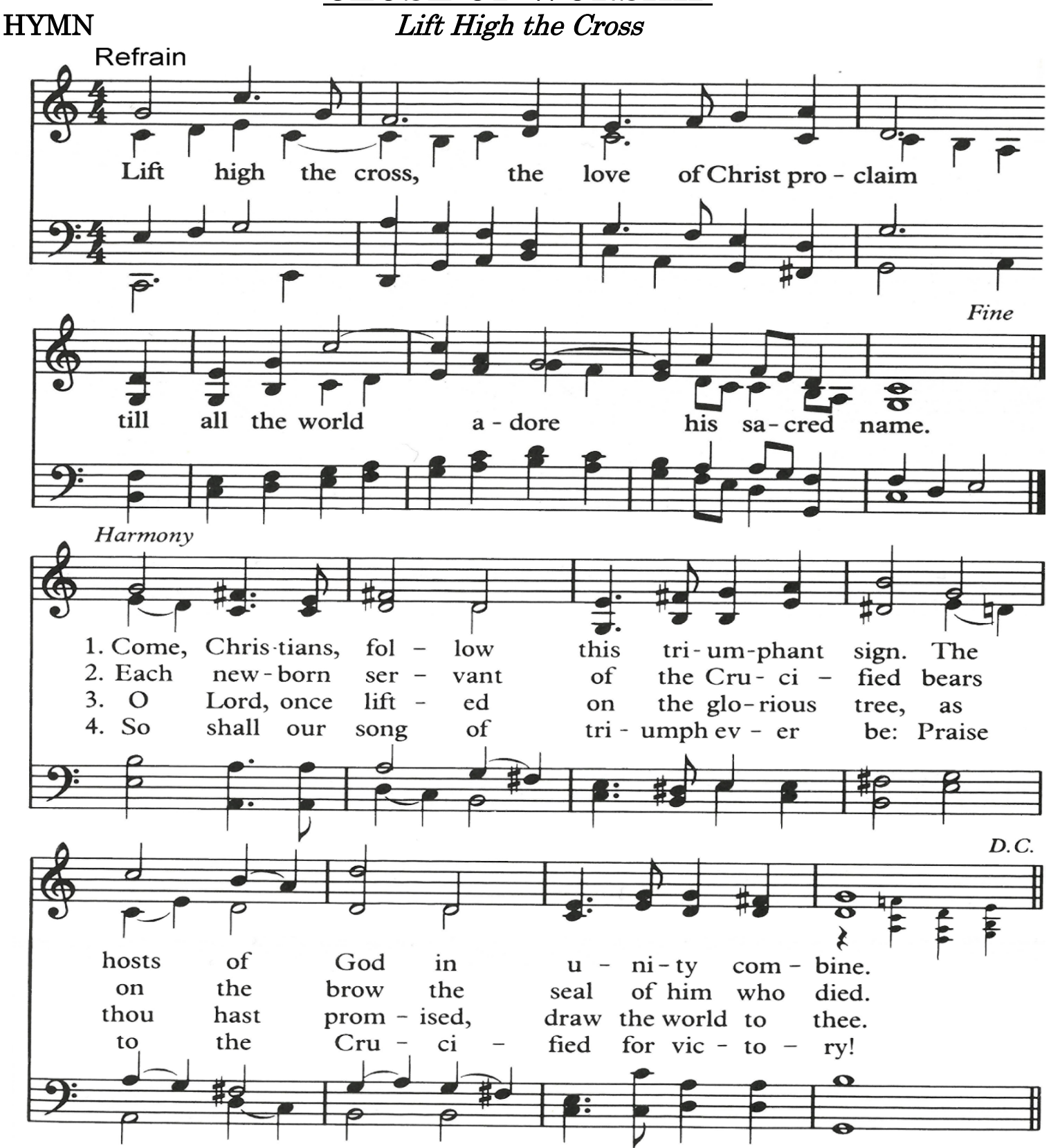
"Lift High the Cross" Words and Music Arrangement @ 1974 Hope Publishing Co. All Rights Reserved. Reprinted under One License #A-711879.