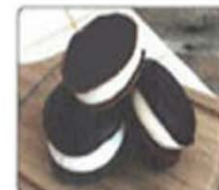
Mini Whoopie Pies

Pack of 12 pumpkin whoopie pies with white filling