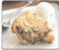
Apple Crumb Pie

Our fundraisers are designed to support your success, with a variety of homemade, high-quality baked goods made from fresh, local ingredients. You can feel good about selling them, and they're specially priced so you can raise funds for your organization.