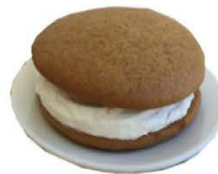
Mini Whoopie Pies

Pack of 12 pumpkin whoopie pies with white filling