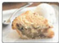
Apple Crumb Pie

Our fundraisers are designed to support your success, with a variety of homemade, high-quality baked goods made from fresh, local ingredients. You can feel good about selling them, and they're specially priced so you can raise funds for your organization.