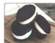
Mini Whoopie Pies

Pack of 12 pumpkin whoopie pies with white filling