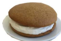
Mini Whoopie Pies

20 oz. loaf made from our own homegrown pumpkins