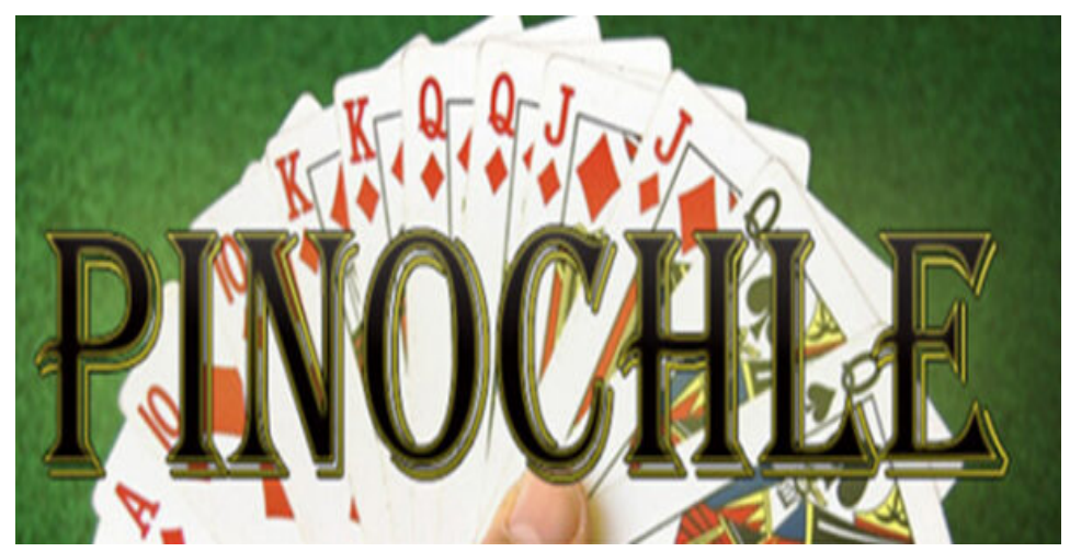
THURSDAY, NOVEMBER 21, 1:30 PM Sign-up sheet on table outside office

Donated items can be placed in the box near the church office!!!