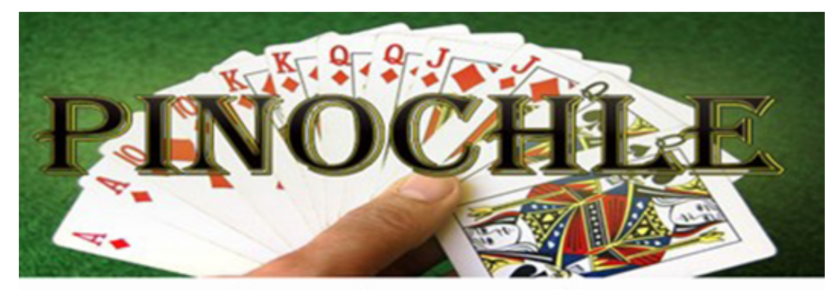
Thursday, April 11 1:30 PM

TRINITY PRESCHOOL FUNDRAISER: It is not too late to buy S. Clyde Weaver sub coupons to support the Trinity Preschool. The cost is $8 per coupon. Look for the sign-up sheet on the table across from the church office. Make checks payable to Trinity Preschool and put in the white box outside the church office.