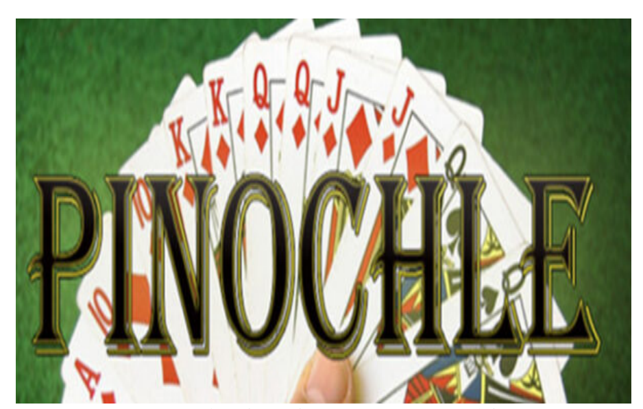
TUESDAY, April 22, 1:30 PM Sign-up sheet on table outside office

2025 CHANCEL FLOWERS AND WORSHIP AID SPONSORS: Upcoming dates for worship aids are: May 4. Upcoming dates for Chancel Flowers are April 27, May 11 & 18. The price for flowers is $60. The price for worship aids is $26. Look for the charts on the bulletin board in the narthex or call Carol in the church office.